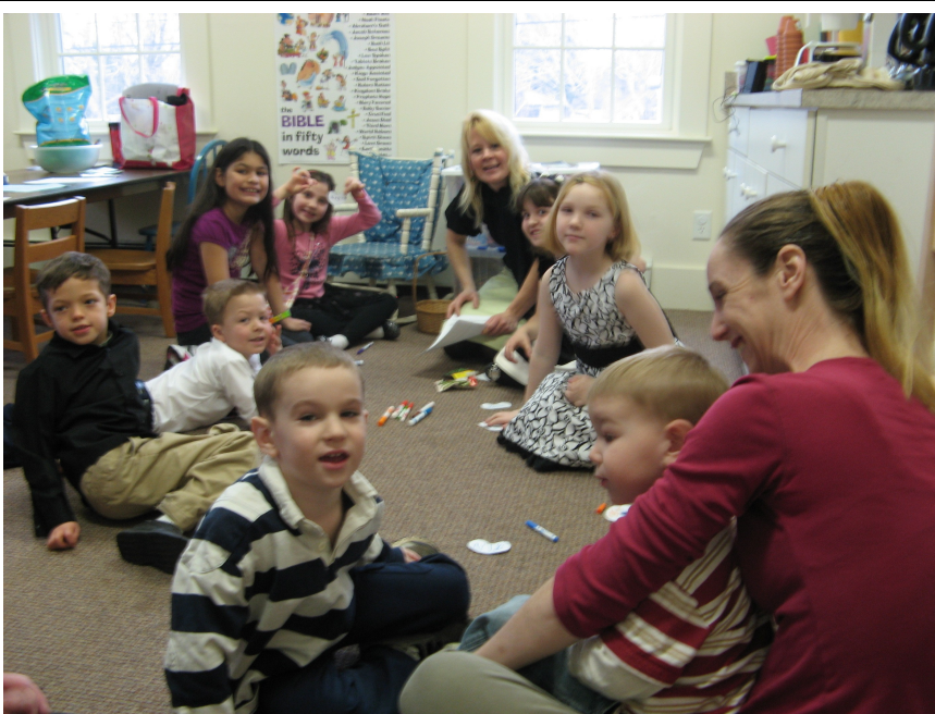
The Circle of "Growth" on Sunday March 4, 2012