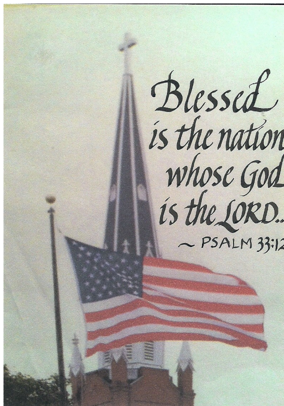
Calligraphy by Sandy Burgio

Visit our web site www.chatham-church.com